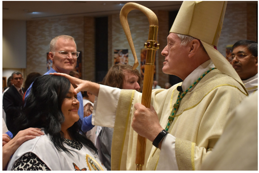
Celebration of the Sacrament of Confirmation during Easter Vigil 2023 at Christ the King Cathedral

formation in faith which has developed over the course of the last fifty years. In addition, the realities of living in the middle of the Twenty-first Century must inform our practice.