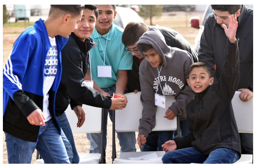
Local World Youth Day 2022 at Saint Anthony Church in Brownfield

Our primary task as Church is to make disciples, not students. As Jared Drees of "The Religion Teacher" likes to say: Students prepare for tests; Disciples prepare for the final test. Students focus on grades; disciples focus on grace. Students learn about Jesus; disciples follow Jesus."