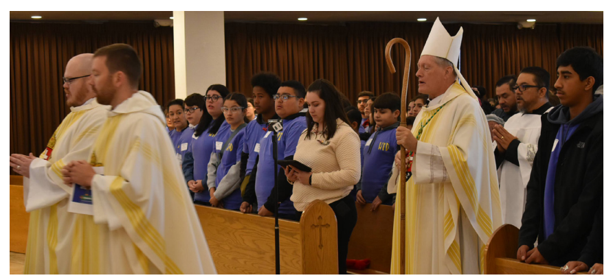
Local World Youth Day 2023 at Sacred Heart Church in Plainview